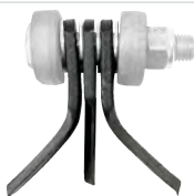
Blade A03 Optional