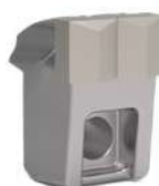
Hammer F23 Optional