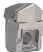
Hammer F45 Optional