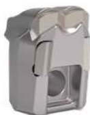
Hammer F20 Standard (sides)