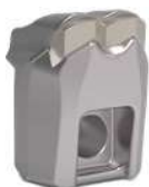
Hammer F19 Standard