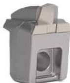
Hammer F25 Optional