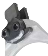
Hammer A06 Standard