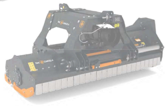
Combination with front models (not included in price) TS-760 + THN-320 TS-840 + THN-320