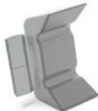
Hammer F39 Standard (sides)