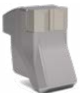
Hammer F29 Standard