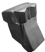
Hammer F29 Standard